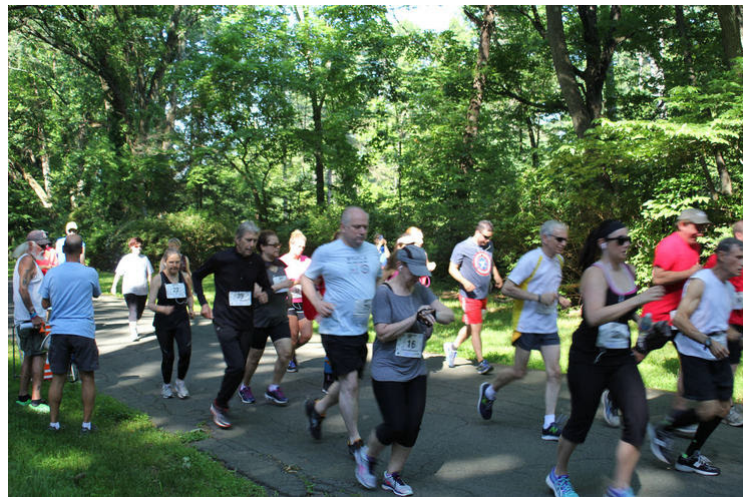
The Annual CASA Superhero 5K and 1 Mile Run/Walk at Washington Crossing State Park in Titusville was a great day of fundraising and friendraising.